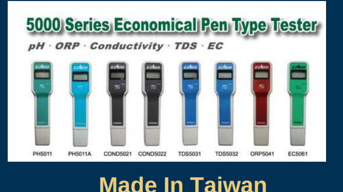
• Fast response, reliable and accurate measurements.