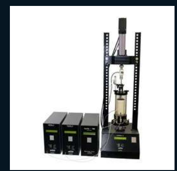
Made In Sweden