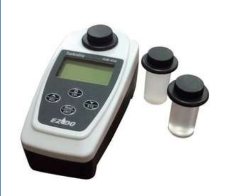
Made In Taiwan