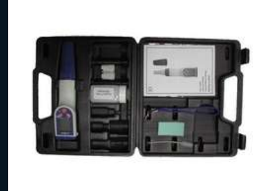
Made In Taiwan